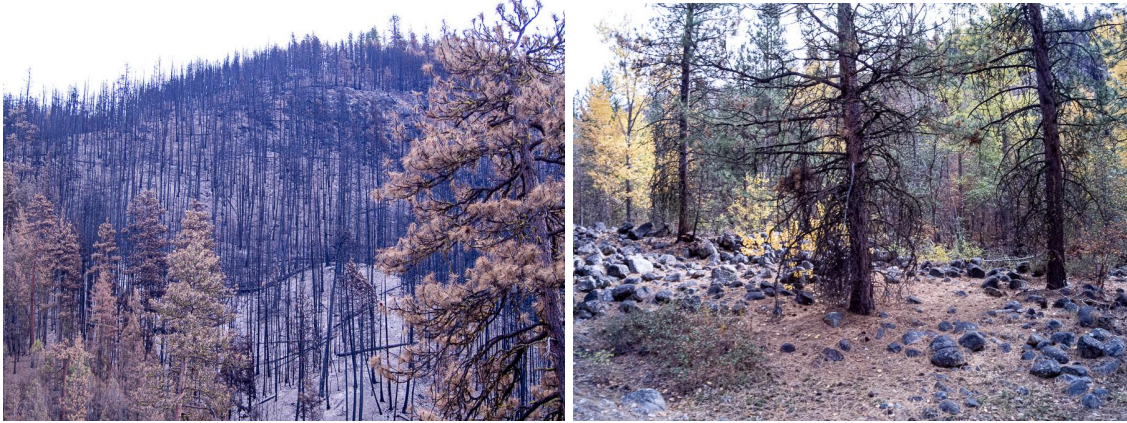
Cub Creek 2 Fire (last week)

Our residents must do a multi-agency check before burning. First check our Okanogan County Website, in the Emergency Management section to see if the burn ban has been lifted (here's the link - https://okanogancounty.org/government/emergency_management/index.php ). Then you should check DNR NE region, and then the Dept of Ecology website.